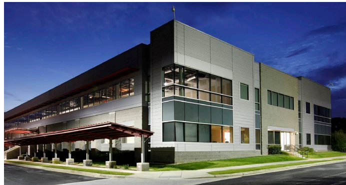
Equinix CU1 IBX data center exterior

To learn more about interconnection opportunities in Culpeper, visit the Explorer feature within Equinix Marketplace .